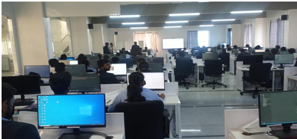
24-02-2024, 9:20AM-11:50 AM-(CSE&IT: Room No.7310)