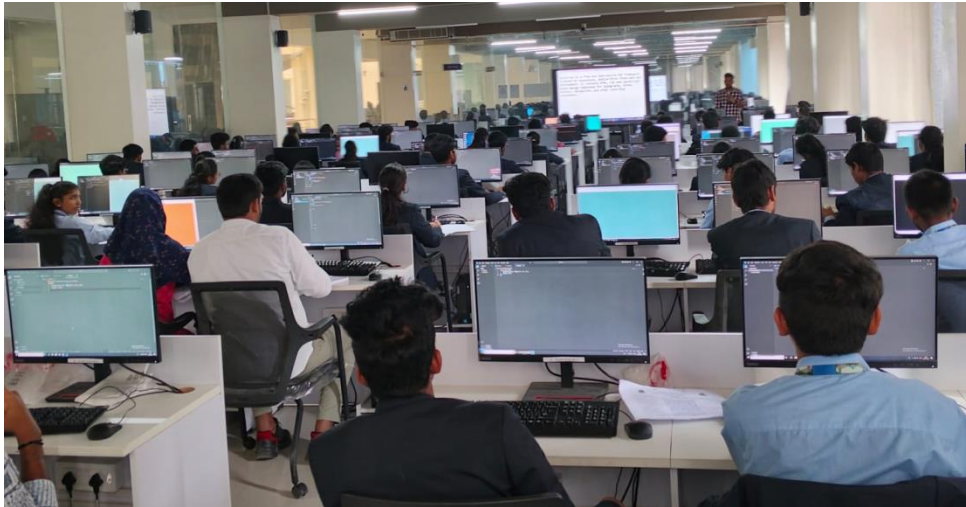
24-02-2024, 1:20PM-3:50PM (CSE(AI&ML)- A& B IT- C: Room No.7113)