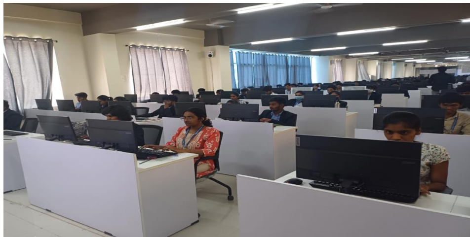
24-02-2024, 1:20PM-3:50PM (IT- B& C: Room No.7112)