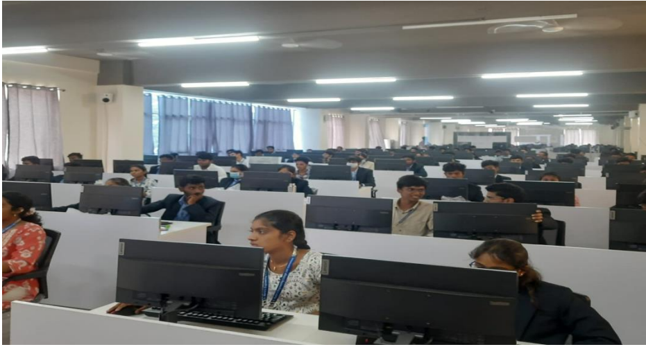
24-02-2024, 9:20AM-11:50 AM-(CSE: Room No.7112)